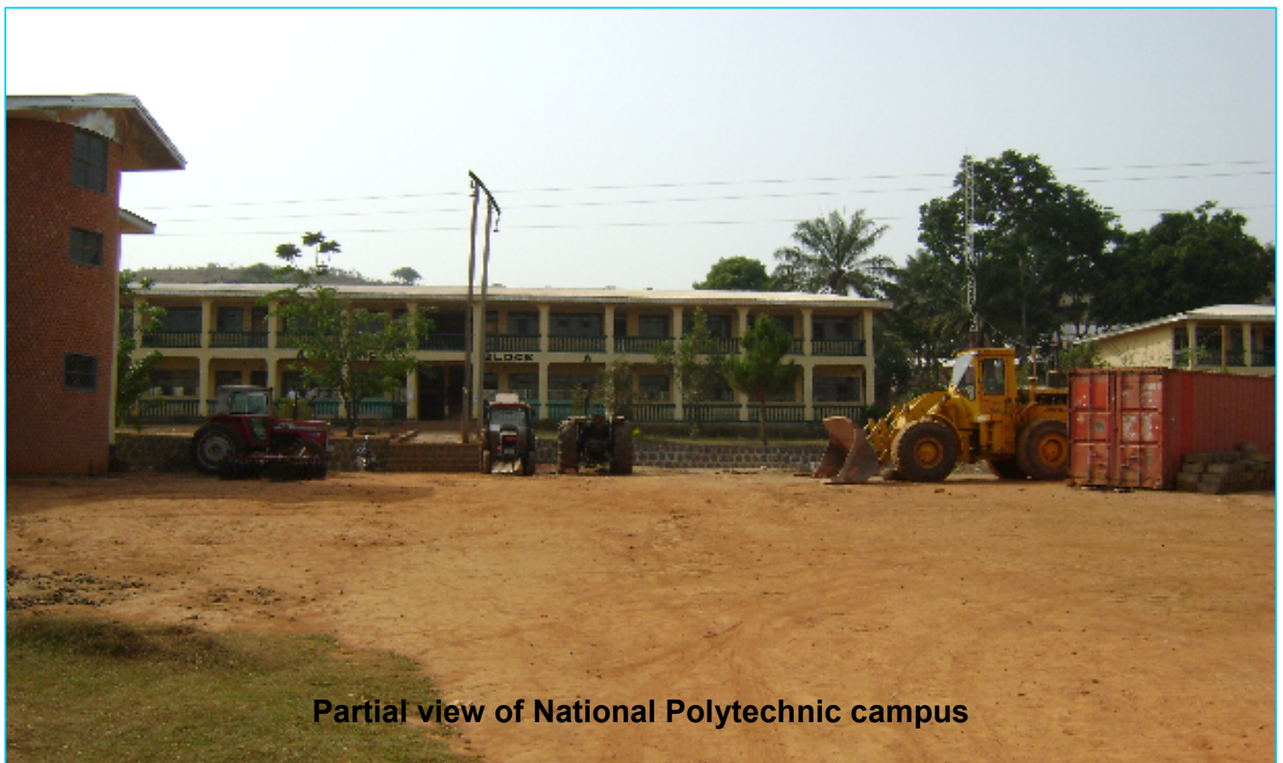
Partial view of National Polytechnic campus

National Polytechnic Bambui (NPB) is a broad based institution of higher learning with main purpose to encourage, promote and facilitate the advancement of academic, professional, and technical achievements for all.