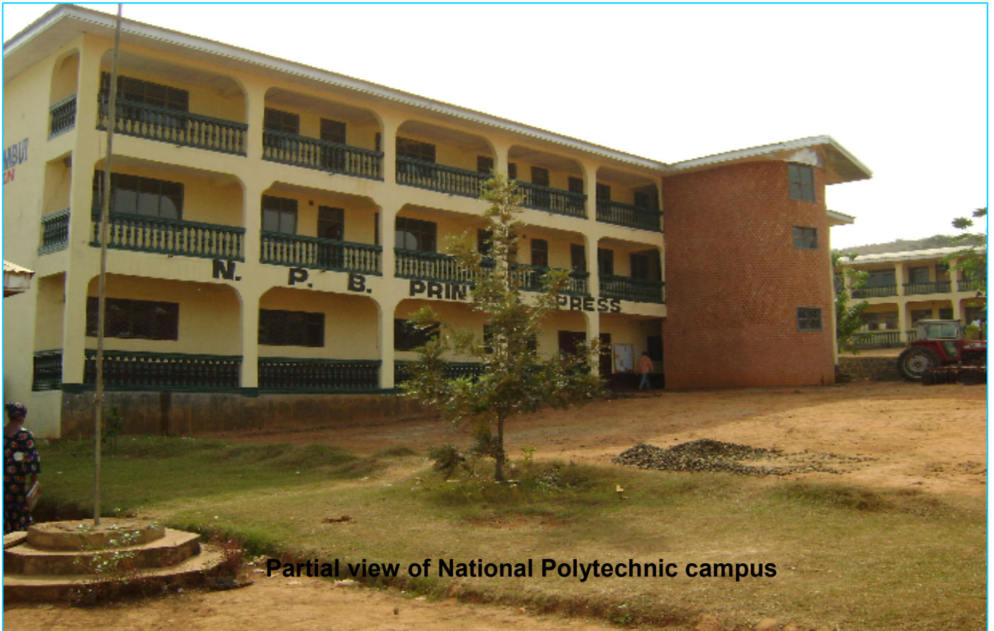
Partial view of National Polytechnic campus

The academic programmes of NPB are highly oriented towards business, science and technology. The programmes offer students excellent opportunities for acquiring academic, professional, technical, and vocational skills, which are necessary to meet up with the challenges of developing nations in the 21 st century. The interdisciplinary nature of the programmes offers wider horizons to meet student aspirations in agriculture, industry and tertiary services.